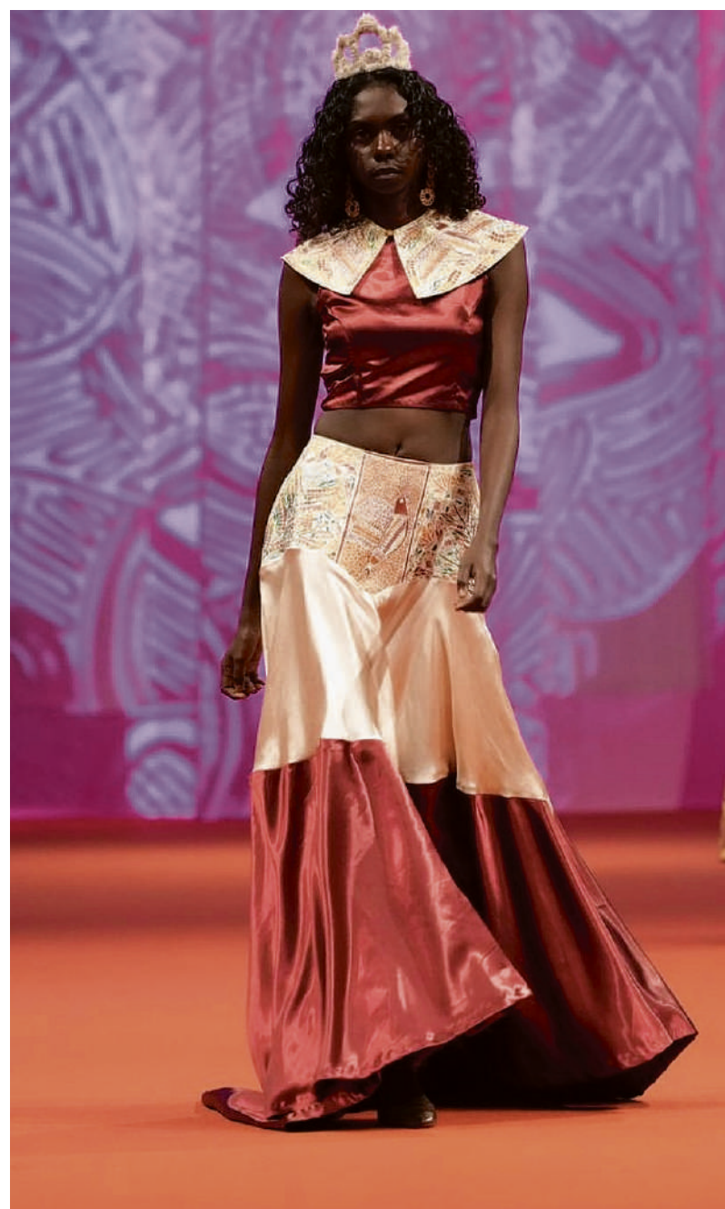
From the 'Garkambarryirri' (Daybreak) collection.

She would love to see more collaboration on the Country to Couture runway, as it provides exposure and opportunities for remote artists, art centres and designers.