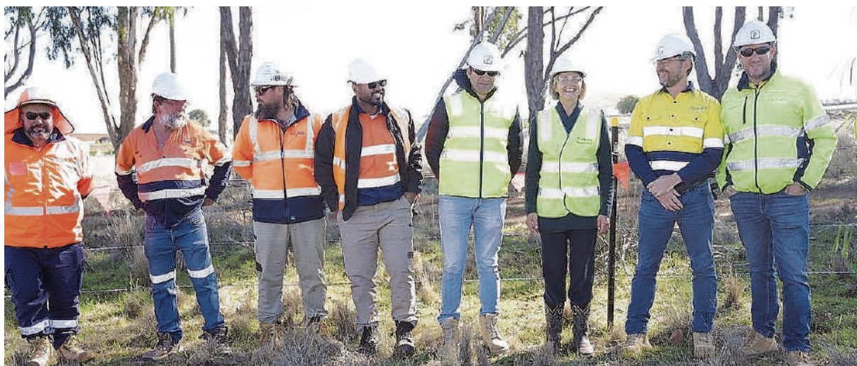
A ceremony was held to mark the Bulabul Battery partnership between Wambal Bila and AMPYR Australia.

The equity arrangement has been developed between Wambal Bila and AMPYR Australia under a set of agreements between the parties, which see AMPYR Australia provide up to $300,000 to support Wambal Bila