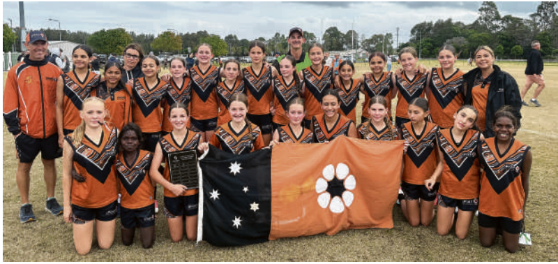
The Northern Territory under 12 girls' team.