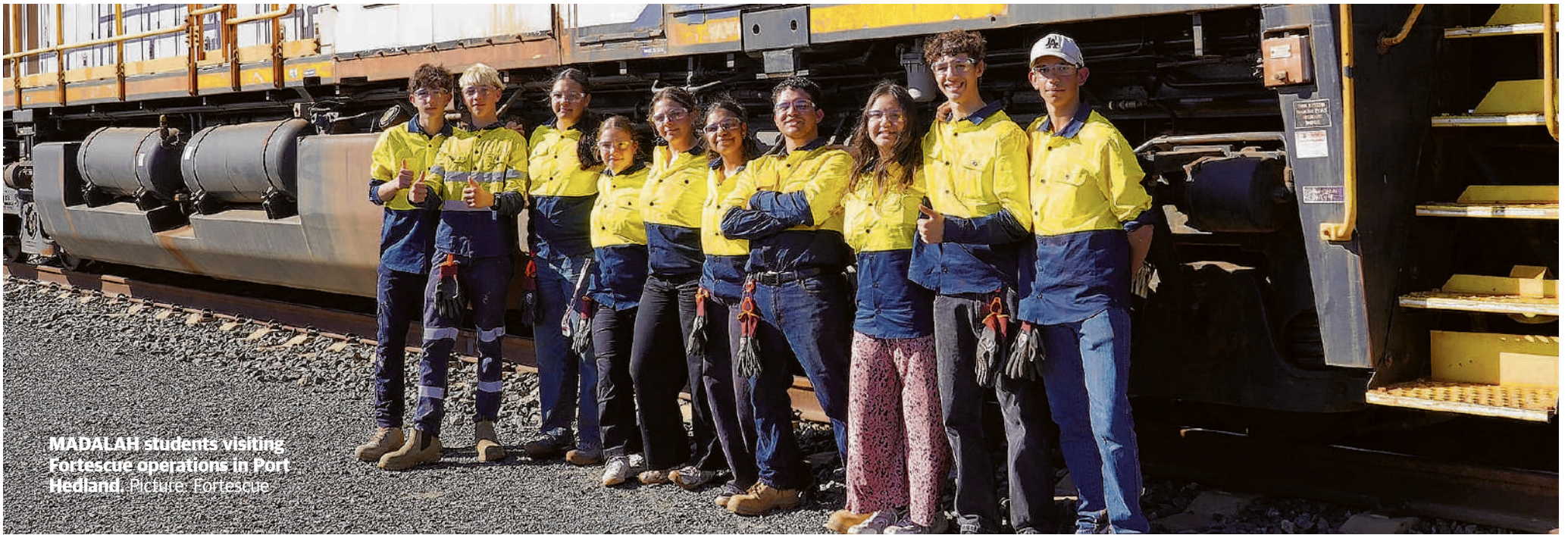
MADALAH students visiting Fortescue operations in Port Hedland.