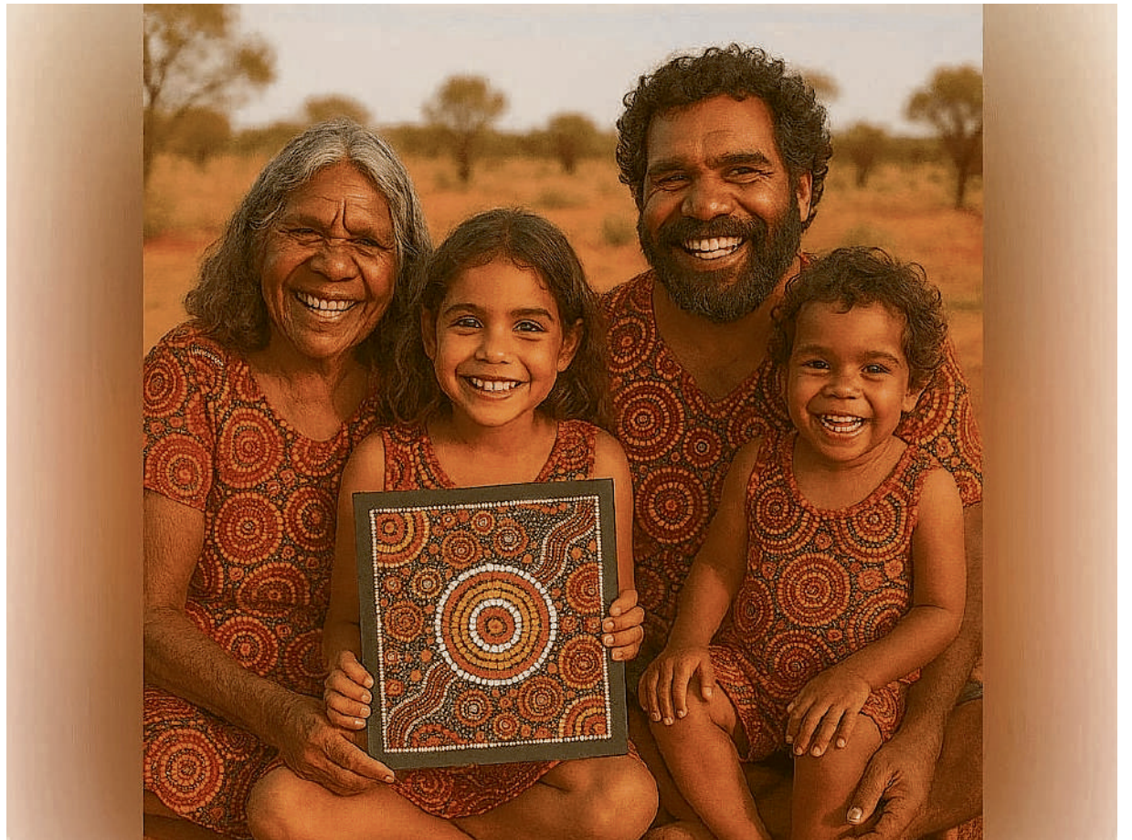
An AI image of a fake "family". Picture: AI generated

For Aboriginal and Torres Strait Islander creators, who already face systemic barriers in accessing opportunities in