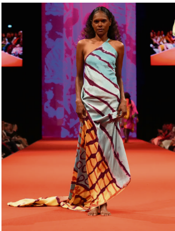
Tjarlirli & Kaltukatjara Art, Pirriya, at Country to Couture 2025.

"You really get to feel the depth of cultural connection and belonging being articulated through textiles and fashion, whilst witnessing