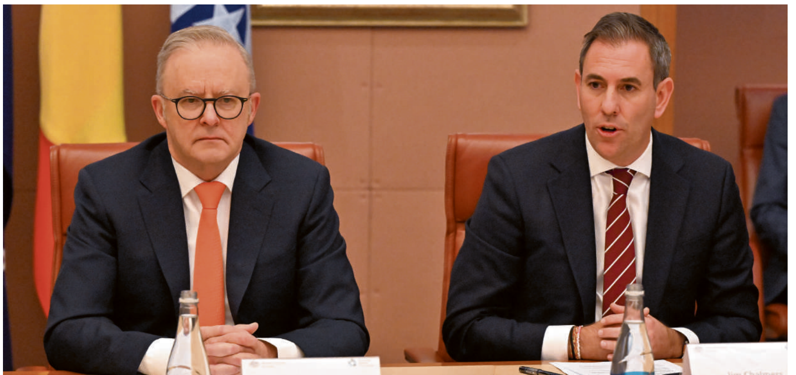
Prime Minister Anthony Albanese and Treasurer Jim Chalmers at the economic round table in Canberra.

“Prescribed bodies corporate are critical partners for Traditional Owners, the first point of contact in commercial negotiations and strong vehicles for First Nations economic empowerment,” she said in regards