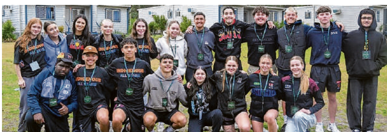
The NRL Youth Summit Top 20 students.

A four-day intensive camp, the Summit aimed to equip the 68 Aboriginal, Torres Strait Islander and Maori Year 11 students to be changemakers in their