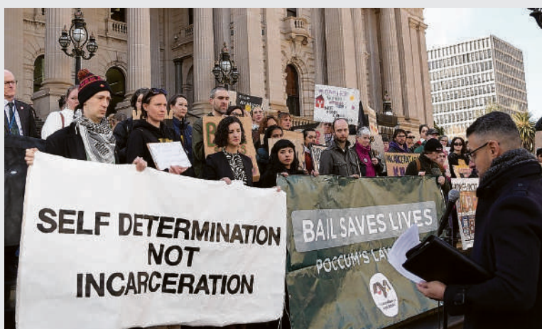
A protest against the proposed bail changes.

“This Bill is irresponsible in the context of escalating remand numbers, deplorable prison conditions and a corrections system at breaking point,” a coalition of Aboriginal and legal organisations said in a joint statement. The coalition, including the Victorian Aboriginal Legal Service, the Human Rights Law